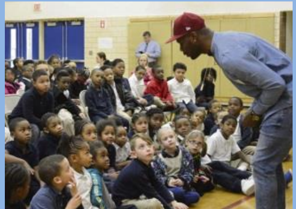
from our January 2017 assembly