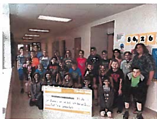
East Union Intermediate

We have enjoyed working with every one of our schools this year on their Pennies for Patients campaigns. With your help, we are making a HUGE impact in blood cancer research. Here are some of our favorite moments from the 2017-2018 Pennies for Patients campaign: