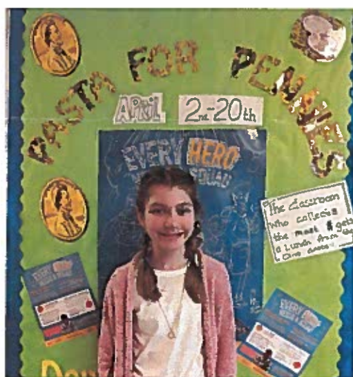
Eva Raised Over $1,300!