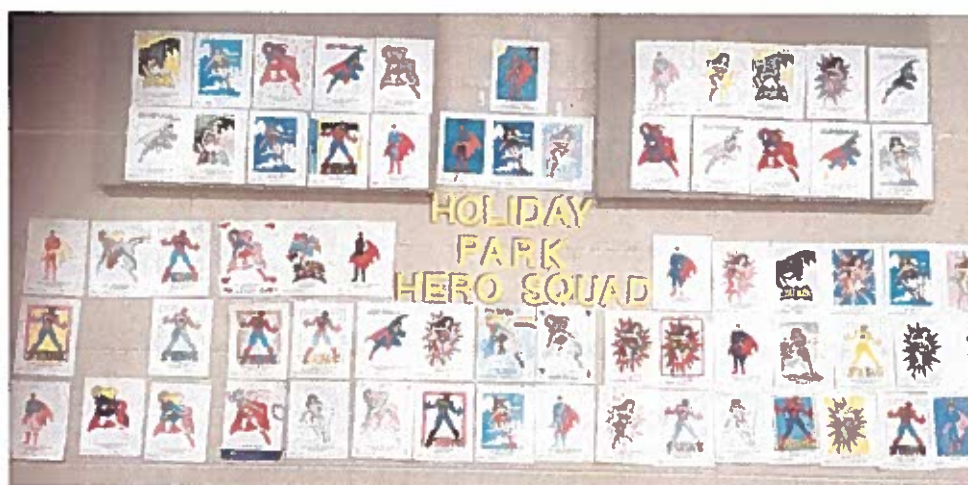
Holiday Park's Hero Squad Challenge