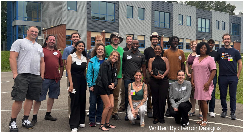
Written By : Terroir Designs